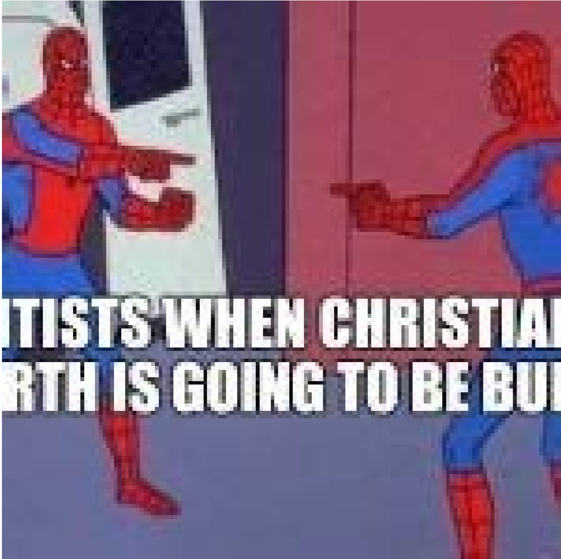
7 spiderman pointing meme template. Multiple spiderman pointing meme template. 4 spiderman pointing meme template. 5 spiderman pointing meme template. 3 spiderman pointing meme template.